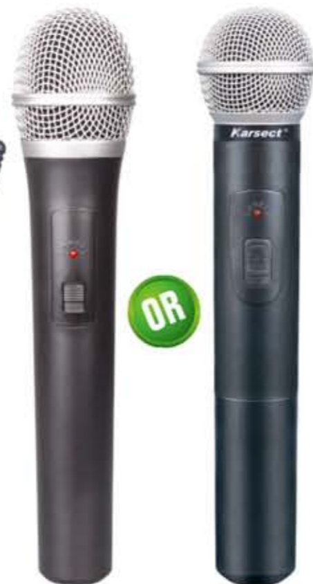
HT-68V HANDHELD TRANSMITTER