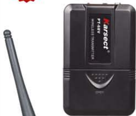
PT-68V BODYPACK TRANSMITTER