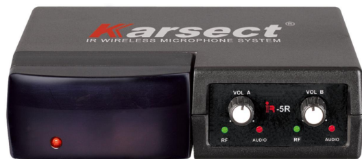
① IR-5R DUAL CHANNEL RECEIVER