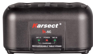
① IR-5C RECHARGEABLE TABLE STAND