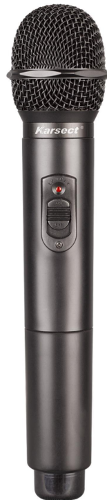
① IR-5T HANDHELD TRANSMITTER