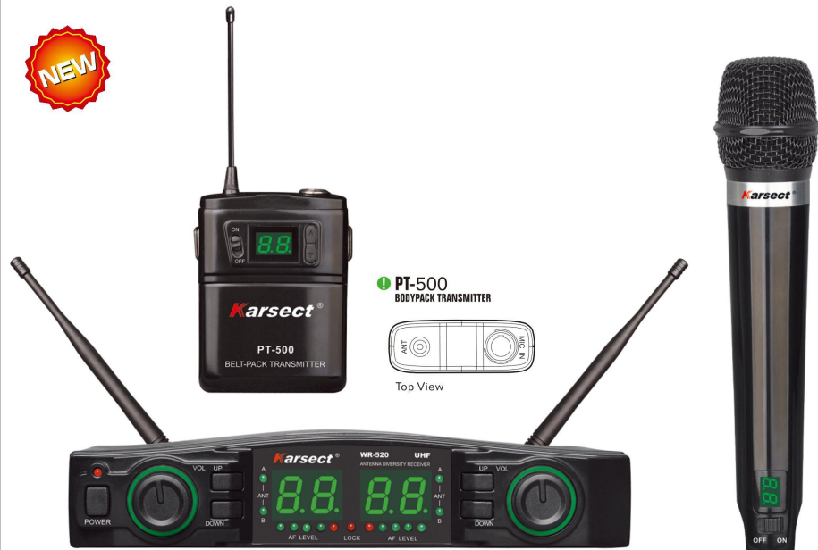
PT-500 BODYPACK TRANSMITTER