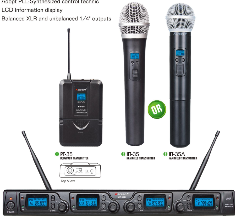
PT-35 BODYPACK TRANSMITTER Top View