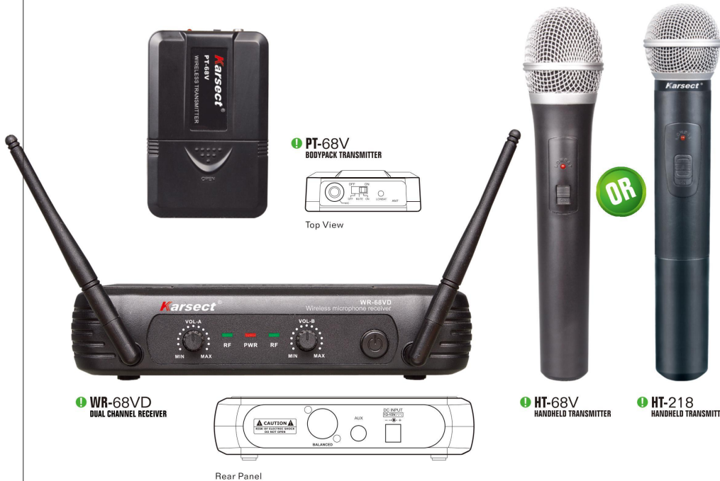
1 PT-68V BODYPACK TRANSMITTER

Carrier Frequency:170~260MHz RF Power Output: >13dBm Modulation Degree: >30KHz Power Current: <110mA Frequency Stability: ±0.002% Harmonic at Higher Degree: <60dB Modulation pattern: FM Power Requirements:3V (2x1.5V AA) Dimensions:10X6.5X3cm