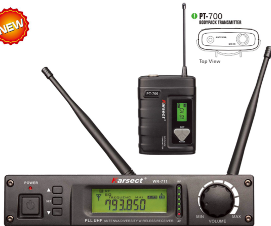
PT-700 BODYPACK TRANSMITTER