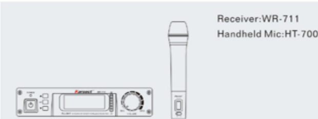
Receiver:WR-711 Handheld Mic:HT-700