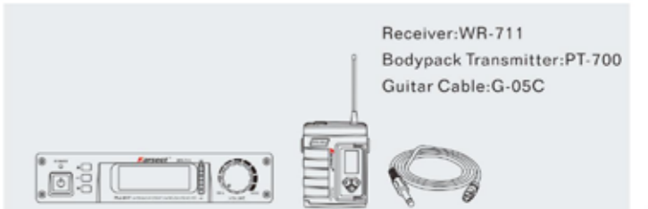
Receiver:WR-711 Bodypack Transmitter:PT-700 Guitar Cable:G-05C