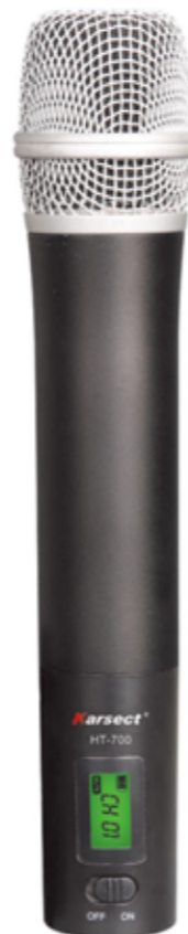
HT-700 HANDHELD TRANSMITTER