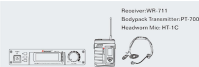
Receiver:WR-711 Bodypack Transmitter:PT-700 Headworn Mic: HT-1C