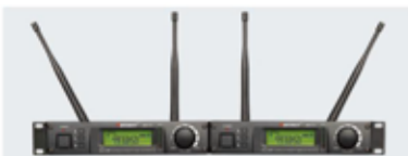
WR-711 ANTENNA DIVERSITY RECEIVER